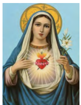
Our Blessed Mother

On the last weekend of every month the knights of our council have the honor and privilege of saying our Blessed Mother’s holy rosary 30 minutes before each mass on the weekends. Come out and show your support for this and on the last weekend of the month